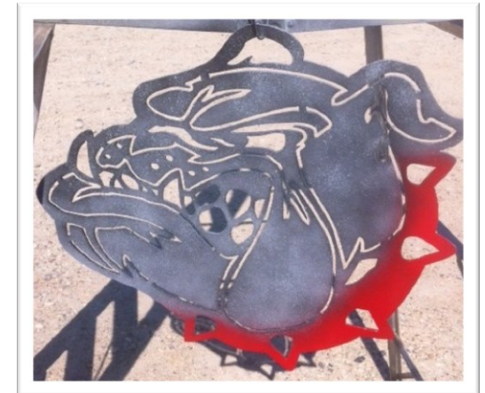
Ready for painting