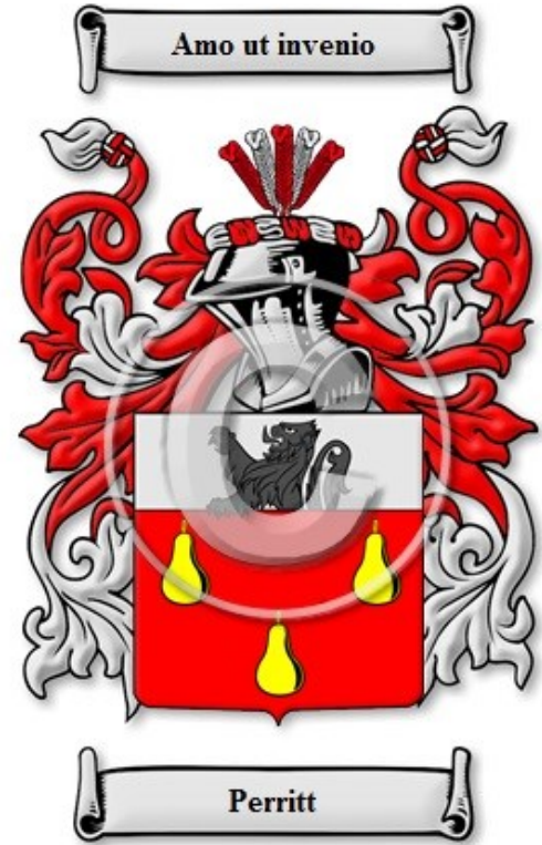
Personalized Family Crests