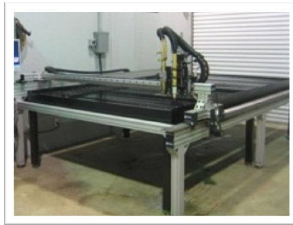
Plasma cutting table